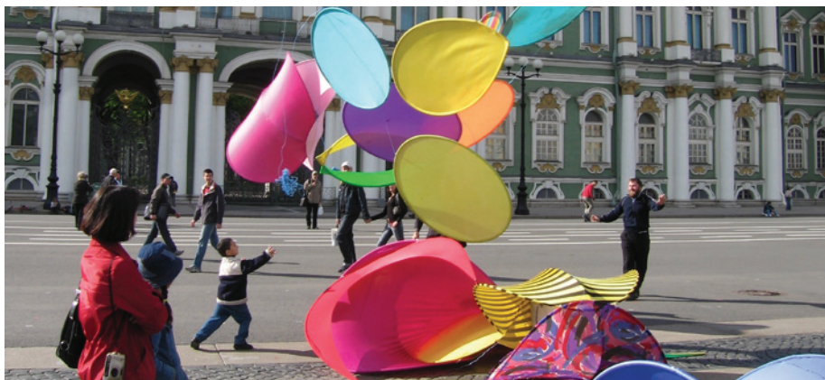
Angel Orensanz | Wind Tides 2, Hermitage Museum Square, St. Petersburg | 2005