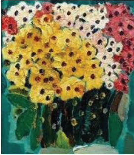
Zereteli | A Spray of Bright Flowers | 2005