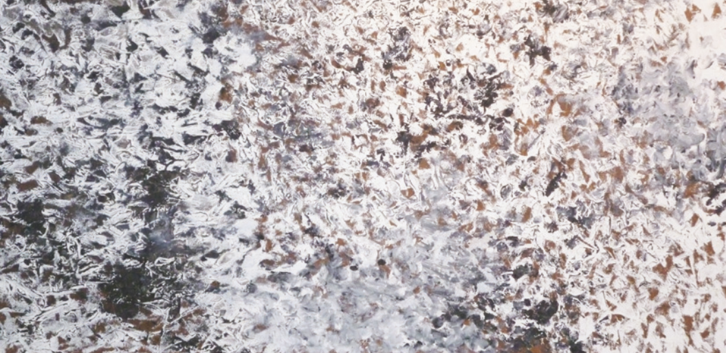
Serge Sinitsyn | Untitled | 2011