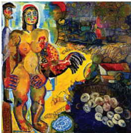
Zereteli | Coh | 2002