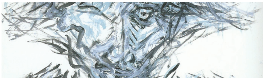
Angel Orensanz | The Hunter, Rendsburg | 2000 | Yan Leus was inspired by these series of drawings.

During the II Russian Arts Festival, the original recording of Yan Leus concert will be played two nights: on opening night, November 14, and on December 14.