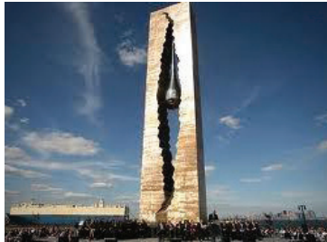
Zereteli | "To the Struggle Against World Terrorism", Bayonne, New Jersey (USA) | 2006